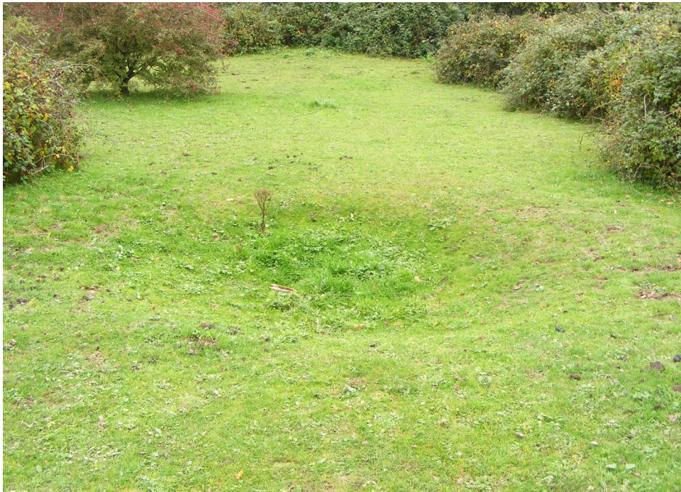
The bomb crater, looking south down the hill (Taylor 2010, 15).

One of the bomb census maps for Brislington shows a bomb exploded in the small paddock immediately southeast of the kissing gate that leads directly into the fields of Brislington Meadows from the west (Culture24 undated). A small crater around 3m in diameter and 0.5m deep was seen in this field during a visit in 2010 at OS grid reference ST62447102.