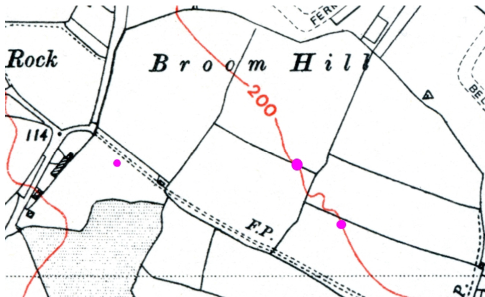
Sites of three large bomb craters in and near Brislington Meadows that were recorded by the RAF on 29 Sept 1941 (sketched on a 1938 Ordnance Survey map).

An aerial photograph taken on 29 Sept 1941 (RAF 1941) shows two large bomb craters in Brislington Meadows (approximate Ordnance Survey grid references ST62617113 and ST62657106), with another large crater in the allotments nearby (approx. ST62387113). The sketch map illustration shows two of them coincidentally lying on the 200 feet contour line.