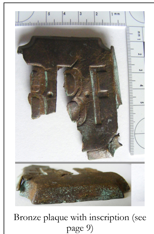
Bronze plaque with inscription (see page 9)

Email us - secretary@brislington.org - to enquire about any of our community museum's exhibits, to provide feedback or new information etc about them, or to contribute items for this newsletter. We aim to produce this quarterly, but our schedule is flexible so we can react quickly to urgent important events (also, during quiet times we can focus on other matters such as out-reach activities and sourcing and researching new exhibits).