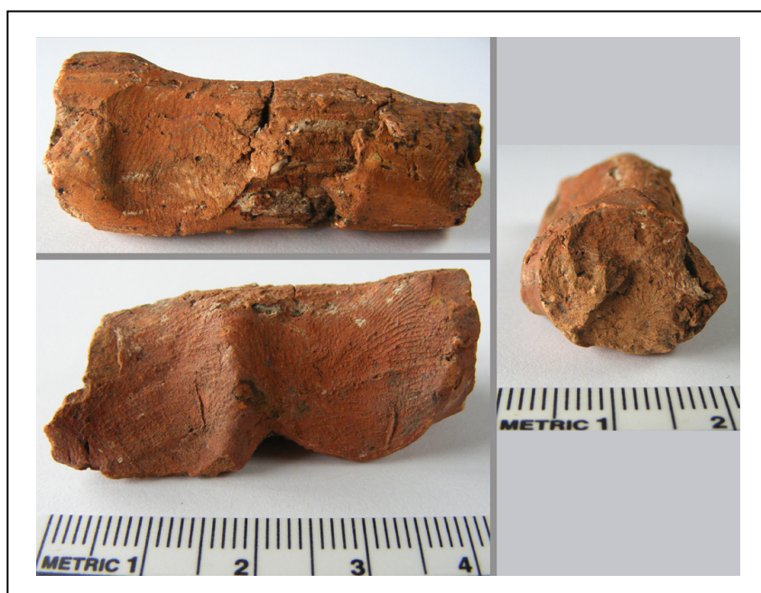
Exhibit contributed by Ken Taylor Acquisition number: 120224b1

Find spot: Hampstead Road, Brislington, Bristol. ST 612710